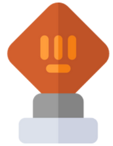
Bronze (12 000 EUR)

! Companies wishing to support the ESE at Diamond and Platinum levels must become ESE Corporate Partners for the period 2023-2025 inclusive. That is, Diamond and Platinum packages are not available for single congresses.