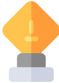
Gold (40 000 EUR)