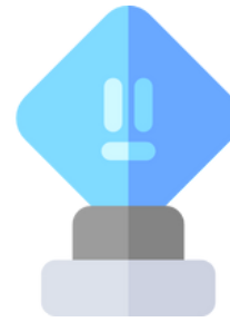
Silver (25 000 EUR)